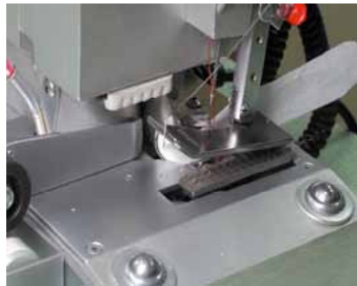
Wide pressure foot