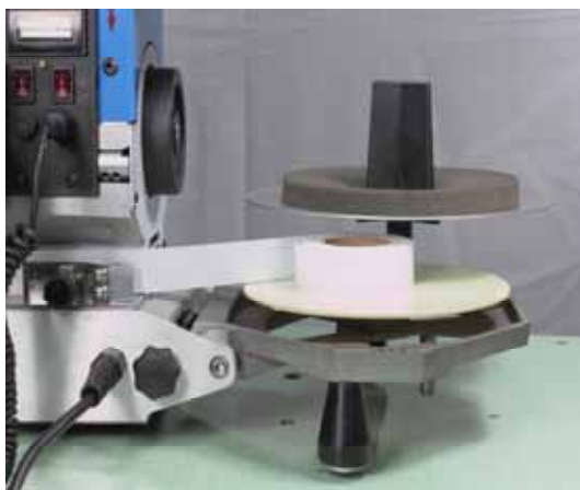
Ample space between the upper & lower plates for large wider tape