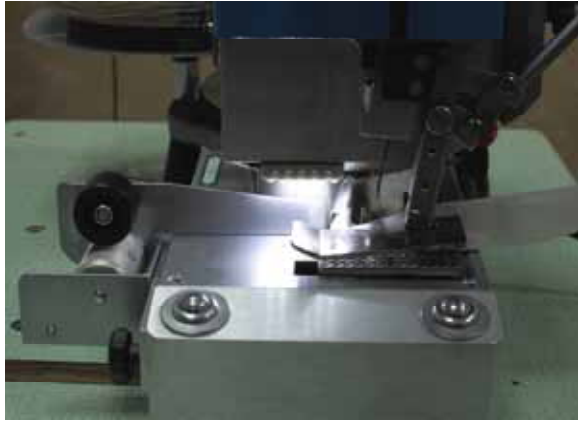
Built-in LED light to illuminate the working area