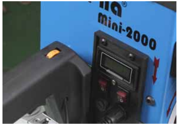
Variable speed electronically controlled