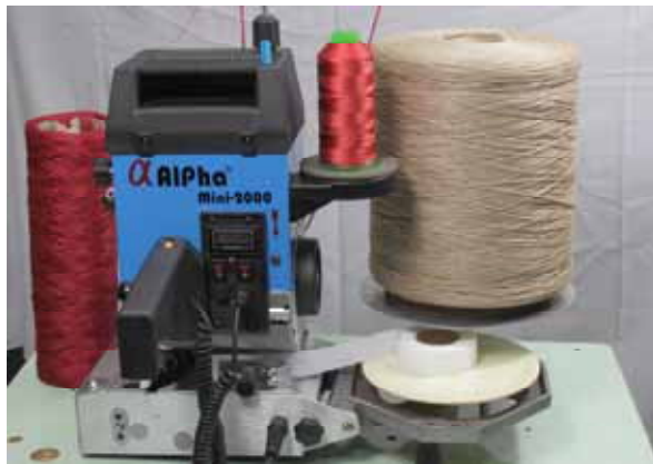
Optional enlarged thread plate for large yarn is available